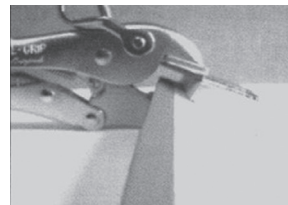
"Best Practice" Recommended Clamp Position (Clamp inside of Edge Seal)