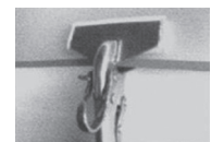
Improper Clamp Position (Do not clamp on Edge)